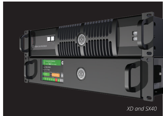
XD and SX40

Additional XD units can be daisy-chained together to extend the signal, allowing screens in different locations to be connected to a single 10G trunk. All ten 1G outputs on each XD can be used, as long as the combined pixel load on all ports of the same number does not exceed the pixel capacity of a single 1G link.